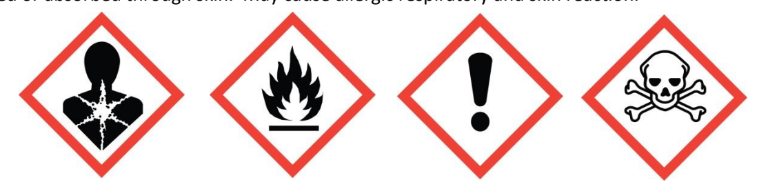
Section 3: Composition/Information on Ingredients